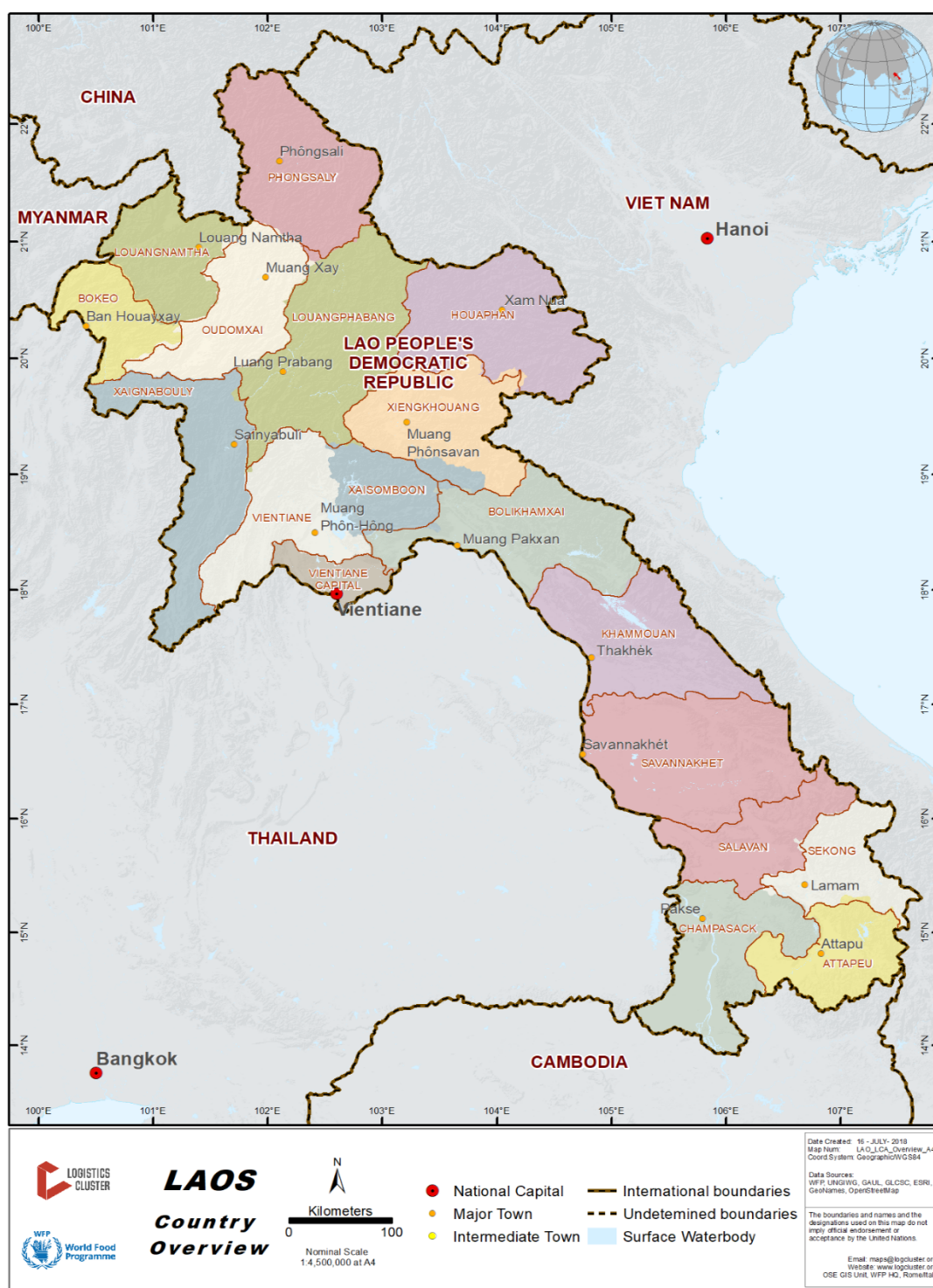
Figure 3.1. Geographical location of Laos.