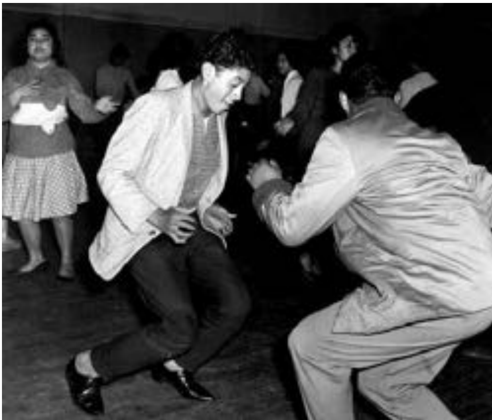
Figure 9. Auckland Māori Community Centre, 1960s: Photograph by Ans Westra. Ref: AAMK W3495/28H. Archives New Zealand - Te Rua Mahara o te Kāwanatanga.

Nah, it's racist as fuck. I mean, I think New Zealand is the best place on the planet, but it's a racist place... They're like, 'Oh, you've done so well, haven't you? For how you grew up. For one of your people.' -Taika Waititi. 1