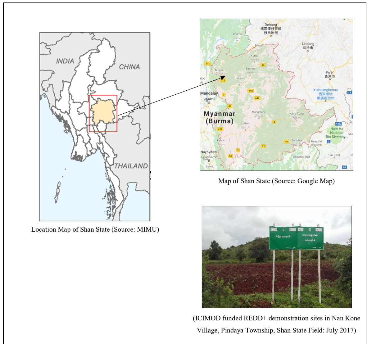
Figure 3.2: Location Map of Case Study Two (Shan State)