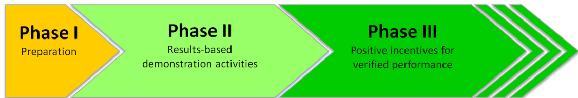
Figure 1.1: Three-Phased Approach to REDD+ under UNFCCC Framework

There are three phases of REDD+ defined by the UNFCCC: (i) readiness or preparation, (ii) pilot implementation, (iii) and full implementation with reporting and verification of performance, or the phase of performance-based payments (UN-REDD, 2016). In the REDD+ readiness phase, countries are required to design action plans and national strategies with relevant stakeholders, to build the capacity to implement it, work on its related policies and measures, calculate forest reference emission levels, address the drivers of deforestation, and design demonstration activities. The pilot implementation phase aims to test the national strategy and action plans designed in phase one, and to provide further capacity building for a full implementation of REDD+. The third (last) phase is to measure emissions reductions and make results-based payments (UN-REDD, 2016, p. 3). Myanmar is in the readiness stage.