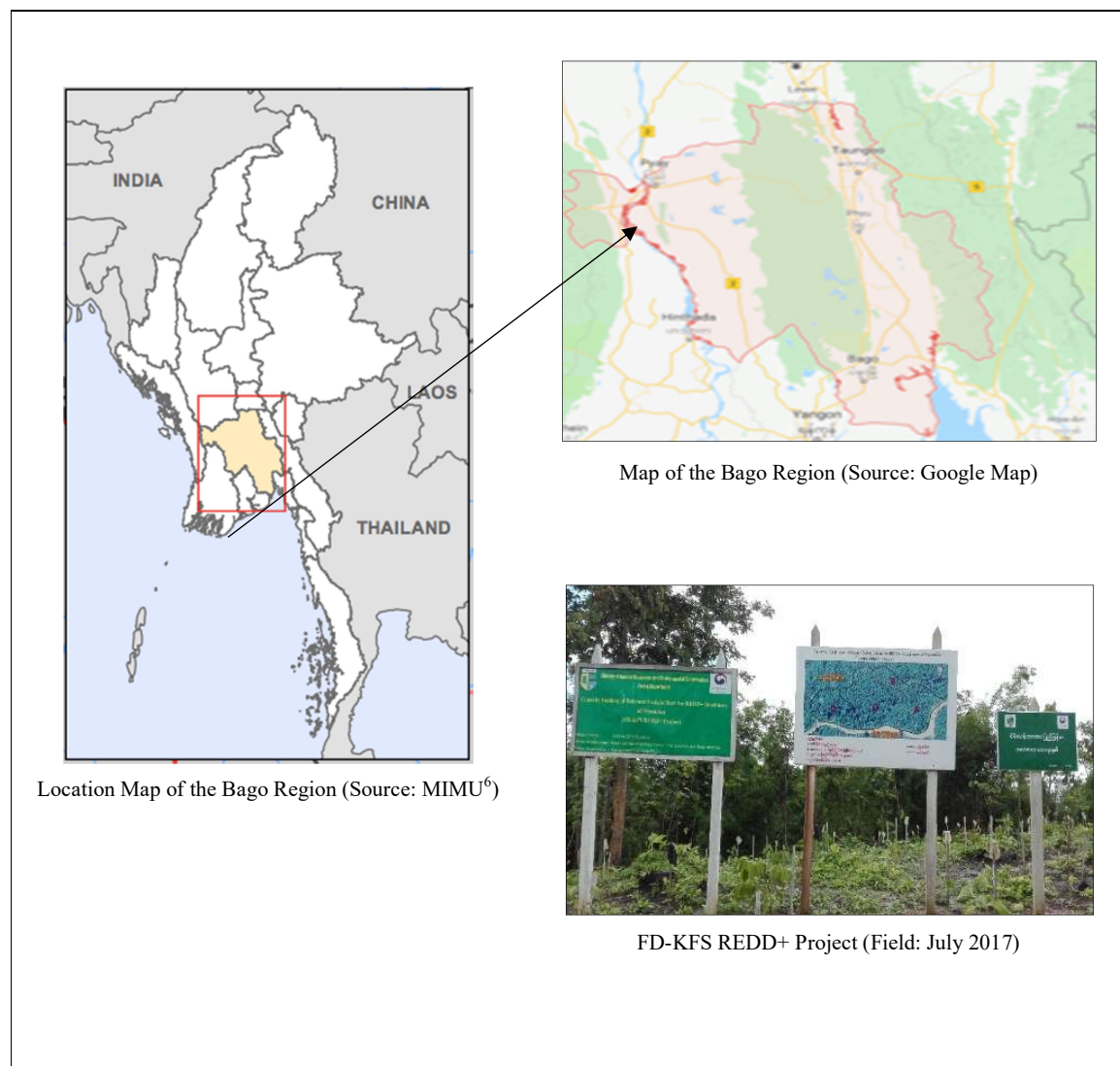
Figure 3.1: Location Map of Case Study One (Bago Region)

After proposing to study in Kyaut Ta Gar Township and visiting Hpa Do village, I realized that the project area is not nearby this village and the local forest department has limited knowledge on how the REDD+ project is being implemented. Neither the local (township level) government nor the local communities I visited were aware of the national government's REDD+ initiative agenda. I did not have enough information and did not get enough support at the local government level to go to the village near the project area and so I did not meet the communities there. However, I did meet one officer from the local forest department and villagers from Hpa Do village who are currently involved in REDD+ related trainings and workshops.