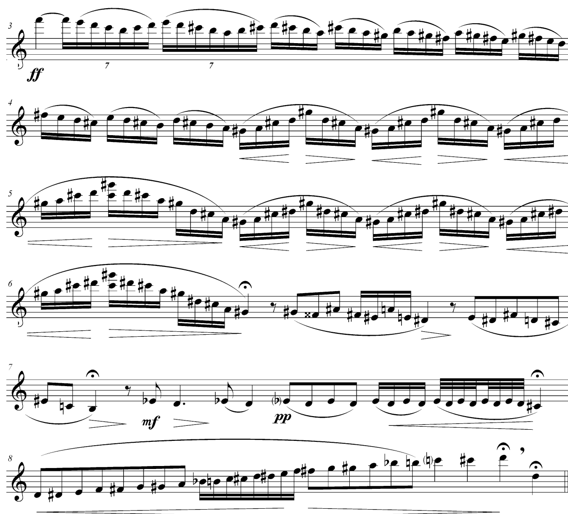
Original cadenza, Concerto by Pierre Max Dubois (see appendix)

cadenza by Dubois was removed and replaced by Londeix's cadenza for publication. 55 The difference between these two cadenzas, in terms of this fast finger virtuosity, is striking. Dubois' original cadenza contains a total of 174 note changes. The fastest notated note values are semiquaver septuplets, which are present at the very beginning of the cadenza. Apart from the two groupings of semiquaver septuplets, the cadenza predominantly comprises semiquavers and quavers.