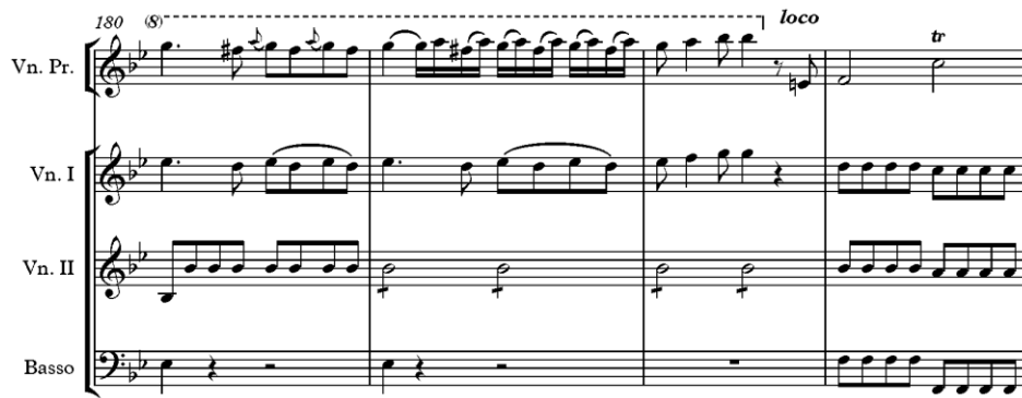
Example 1.4 Vulgar grand cadence 1