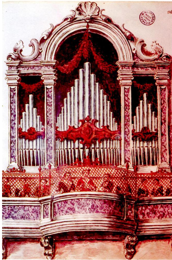
Figure 3. A performance at the Pietà during the eighteenth century – violinists on left. 75

not do musically are a testament to the perceived power that music and the concept of musical freedom carried. 74