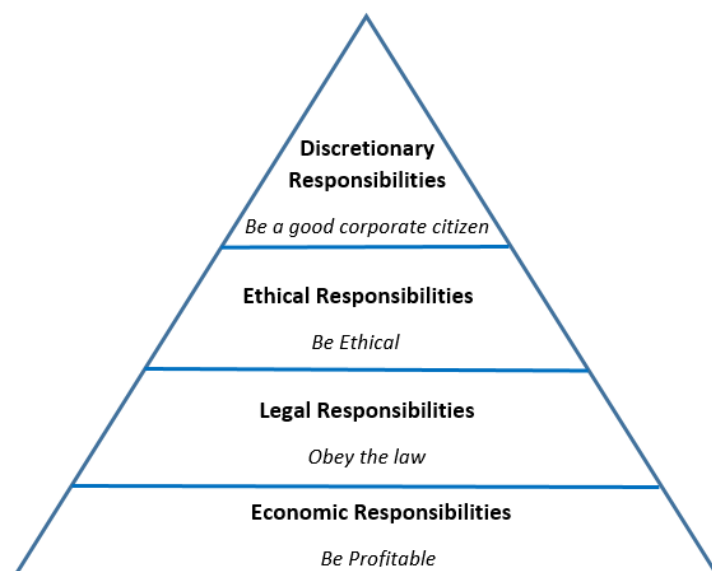
Figure 1 Carroll’s Pyramid of CSR (Carroll, 1991); (Ciprian-Dumitru, 2013)

Carroll’s identification of the four levels that make up CSR have encompassed the wide range of obligations and responsibilities that an organisation has to an equally large range of stakeholders (Carroll, 1979). As a result, succeeding developments in the continuing attempts to define and conceptualise the subject of CSR have been founded on this distinction of the four levels (Fu et al., 2014). While each dimension has been distinguished, Carroll’s 1979 study specified that the four levels were not intended to be considered as mutually exclusive and as such, it is possible for a single corporate action to embody all or multiple dimensions. Carroll’s development of the pyramid of CSR provided a tool through which to gauge greater understanding of the dimensions included within CSR (Aupperle, Carroll, & Hatfield, 1985; Jones, Bowd, & Tench, 2009).