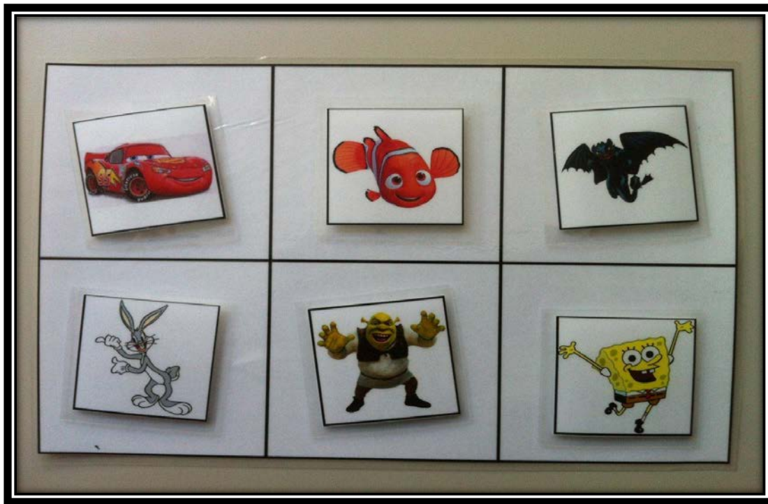
Figure 1. PE board and pictures that were used in the present study