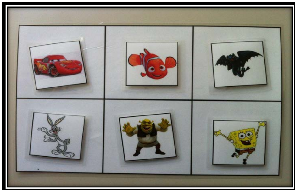
Figure 1. PE board and pictures that were used in the present study

Two PE boards were used in the research study, one for each of the participants. These boards were made of six individually laminated cards with a picture of the main character from each of the six cartoon movies printed in the centre upon a white back-drop. These pictures represented Shrek , Bugs Bunny , Nemo , Toothless (for the movie, How to Train your Dragon ), SpongeBob , and Lightning McQueen (for the movie Cars ). Each card measured approximately 5 x 5 cm. These cards were attached via small Velcro circles to a larger white laminated board measuring approximately 22 x 15cm. Figure 1 shows the PE systems that was used in the study.