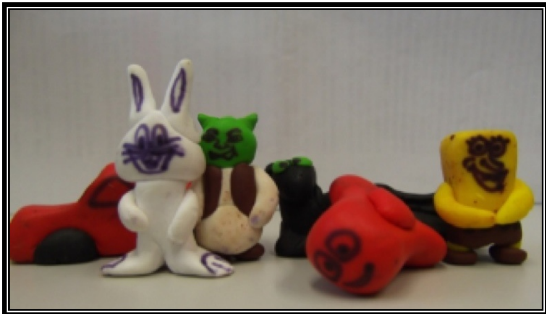
Figure 2. TS used in the present study.