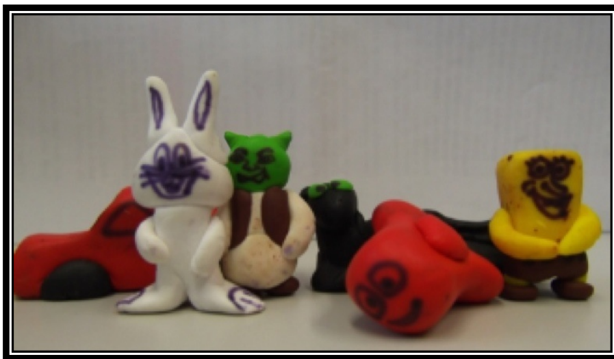
Figure 2. TS used in the present study.

Two sets of TS were used in the research study. Each set of TS included six miniature figurines of each main character from the cartoon movies. Every TS was handcrafted from Fimeo®, a plasticene type material which, when baked, becomes solid and shares a similar texture and durability with plastic. Each figurine represented one of the six main characters from the cartoon movies. The figurines were: a miniature Shrek, a rabbit (Bugs Bunny), a red clown fish (Nemo), a black dragon with green eyes (Toothless), a miniature SpongeBob, and a red car resembling lightning McQueen (Cars). The Tangible Symbols ranged in size from 2 - 6 cm in height, 1 - 4 cm in length, and 0.5 - 1 cm in width. Although these symbols were handmade, they were created to resemble the main characters in each movie as closely as possible. Figure 2 shows the TS that was used in the study.