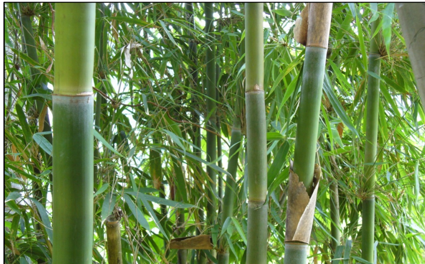
Figure 7: Bvulo culms

The ‘hard’ sound of the mature bvulo is not resonant and does not contain a pitch, but is very sharp and bright, evidence of the extreme hardness of the outer skin in comparison to the soft younger bvulo .