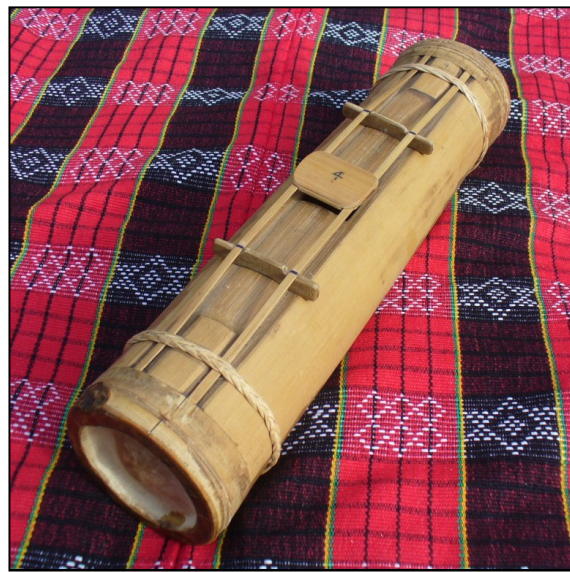
Figure 17: Tambi (two string zither).

The tambi ensemble consists of six, two string zithers. These are more sophisticated in design than the other ensemble instruments, and use the thick walled bamboo, bvuyog . The fibrous skin is carefully carved out and lifted from the body forming two strings. A bamboo striking pad is fitted between the two strings, which are raised using small bamboo bridges. When the pad is struck the strings resonate and are amplified by the tambi 's hollow body via a sound hole below.