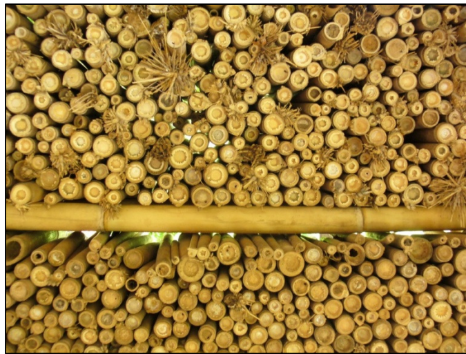
Figure 8: Stacks of bvulo cut to approximate length.

Pattanggok (quill shaped percussion tube), ballingbing (buzzer) and the tongatong (stamping tubes) are all formed from an internode with a single closed node at the bottom end. Other instruments made from bvulo , such as the pattatag (xylophone blades) and paldong (mouth flute) are made from two sections of internode with a node between them. The culms are cut to approximate length according to Beni's experienced eye, and then stacked on a rack covered from the elements by a simple corrugated iron shed to dry further, until Beni is ready to transform them into musical instruments.