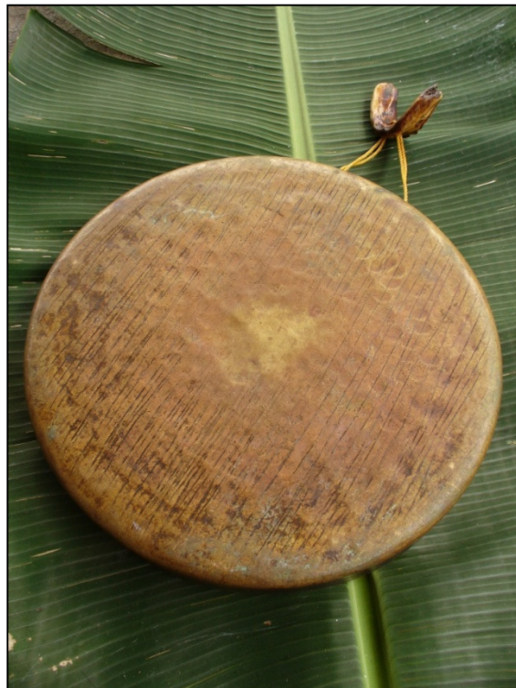
Figure 11: Gangsa (flat bronze gong).