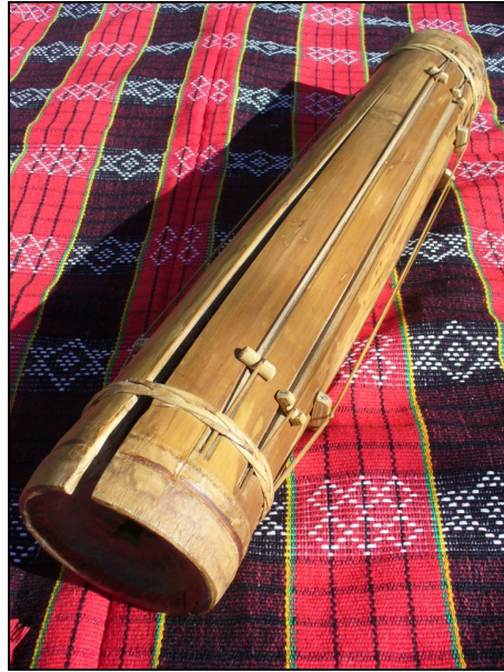
Figure 21: Kolitong or kolibit (six string bamboo tube zither). (Photo by author, August 2011)

of the gangsa and therefore is tuned to the same intervals as bamboo ensemble instruments (as shown in Table 2 above).