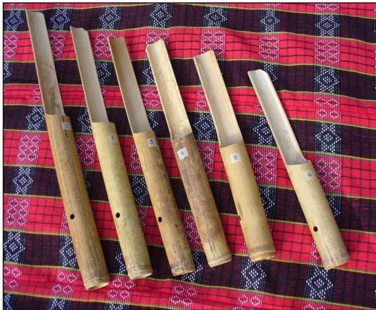
Figure 14: Pattanggok (quill shaped bamboo percussion tube). (Photo by author, August 2011)

remainder of the length. The resonance of the tube is reinforced by the tongue, increasing the volume. The instrument also has a thumb hole near the base of the tube section where the instrument is held. A piece of hard wood, such as coconut, or a head axe as Barton noted (1949: 180), is used to hit the pattanggok with a flick of the wrist, near the centre of the instrument. Opening and closing of the thumb hole produce the okak and bvungog sounds, respectively.