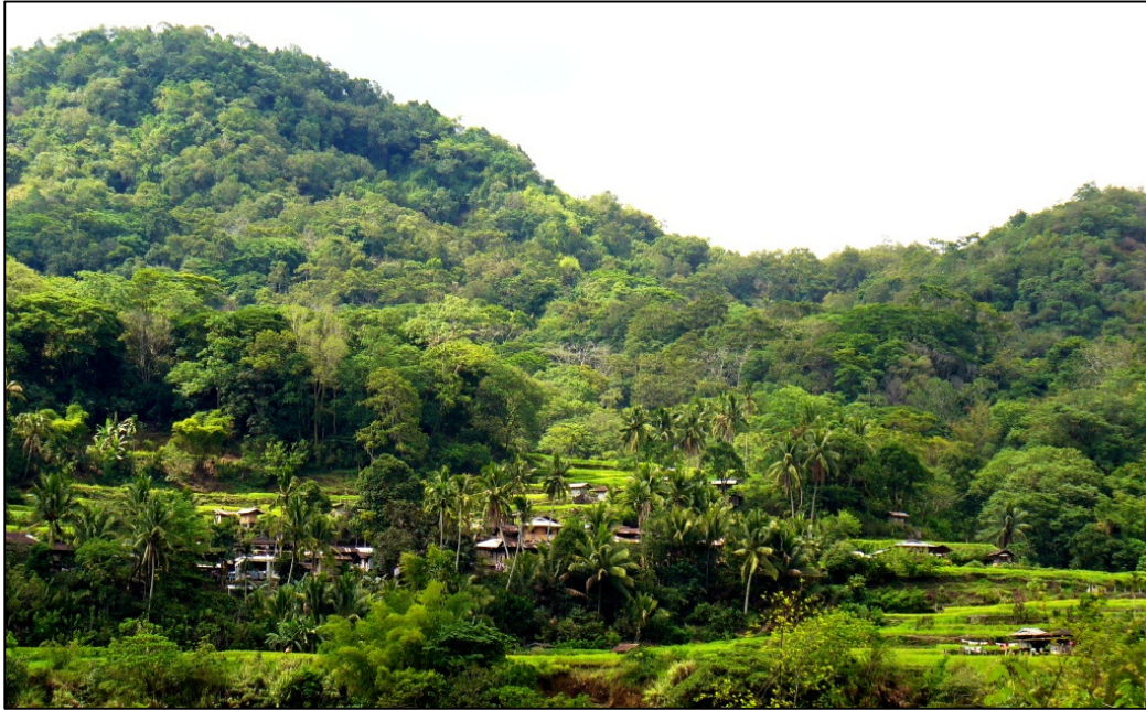
Figure 5: The village of Sukiap nestled amongst the coconut palms and rice paddies (note the plume of bvulo (thin walled bamboo) in the lower centre right of the photo.) (Photo by author, May 2010)

Access to contemporary media such as the internet and television, while ubiquitous in Baguio, has yet to become common in both the villages of Liglig and Sukiap. Electric lighting has been supplied to a few in Liglig and on some occasions, such in the fiesta season in summer, a generator will be used for a television and a DVD player. Battery powered transistor radios, however, are very common. The soap operas and music of the local Kalinga radio and the regional Cordilleran radio station can be heard throughout the villages during the working day. Mobile phones are the most prevalent modern communication technology and coverage is found in both villages. This technology is relatively cheap and enables family members to keep in contact across the world via SMS (text messaging), whereas in the past, a trip to a nearby town was required to use a conventional land line phone.