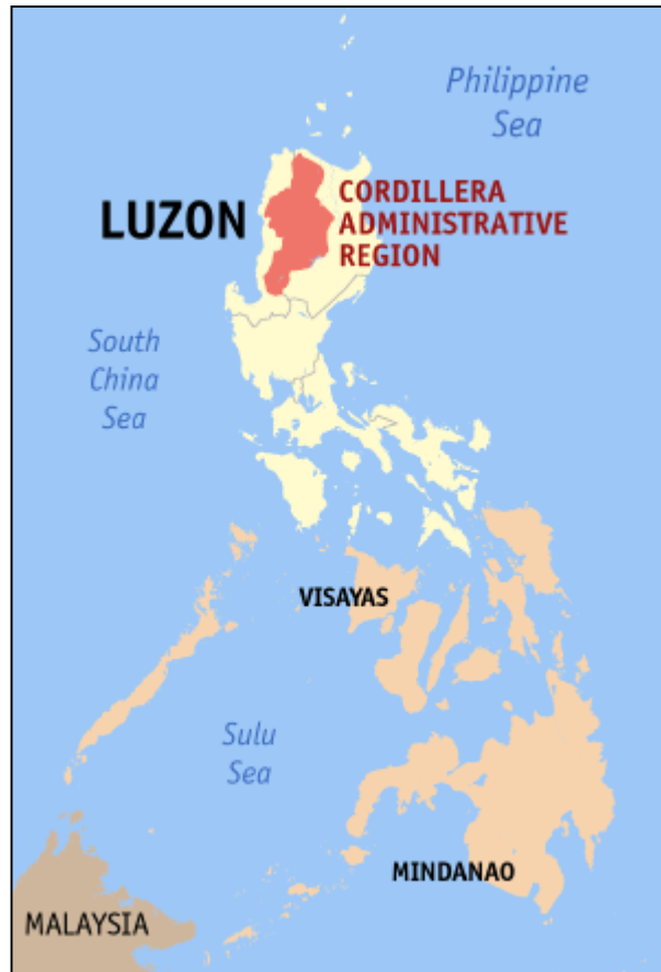
Map 1: Cordillera Administrative Region, the Philippines (Wikipedia.org 2003)