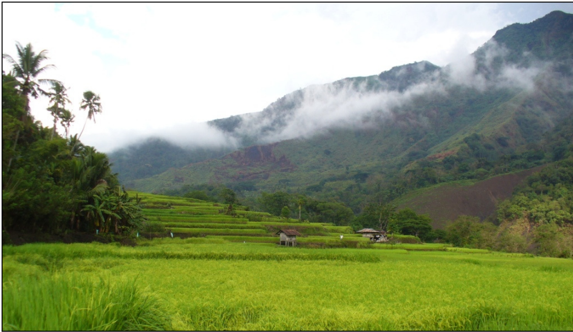
Figure 2: The rice terraces of Sukiap, Kalinga. (Photo by author, May 2010)

school and tertiary education. The students return during the summer holidays when weddings and other festivals are held. Kalinga is the first language for all those born in Sukiap and Liglig, although Ilocano, Filipino (Tagalog), and English is taught within the school system (Benicio Sokkong, June 2007, correspondence).