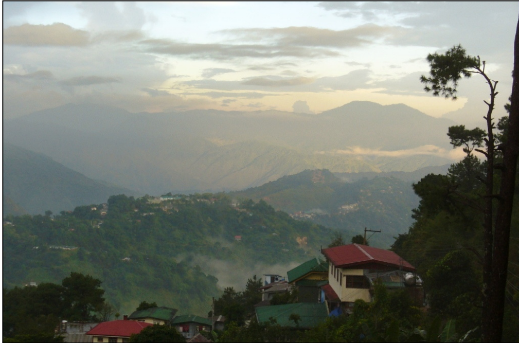
Figure 1: View of Lucnab, Baguio City from Beni's home. (Photo by author, May 2010)

The Baguio City fieldwork was centred in the barangay (village or suburb 2 ) of Lucnab, positioned on the eastern edge of the plateau on which Baguio City is built. Lucnab covers an area of steep ridges and valleys. The Mary Hurst Seminary, the largest building in the barangay , and Beni's home, is located on a one-way road that descends from central Baguio City into the valley below. The barangay still maintains a semi-rural setting; bamboo groves, large pine trees and fertile gardens cover more land than the housing. In the cool mornings, thick clouds cling to the mountainous city, which is over 1500m above sea level (www.gobaguio.com 2009). The population of Lucnab is approximately 1,349 (www.census.gov.ph 2007) and is comprised mostly of migrants from the provinces of the Cordillera Administrative Region, many of which