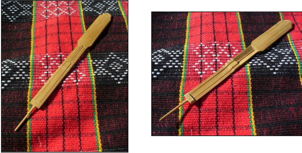
Figure 22: Kulibaw outer face (left), and inner face showing construction (right).