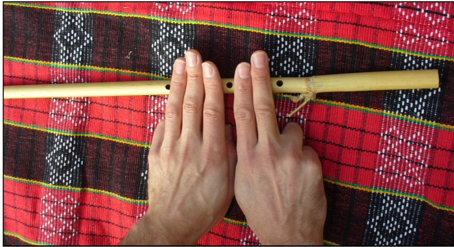
Figure 20: Paldong hole spacing using finger widths as a guide.