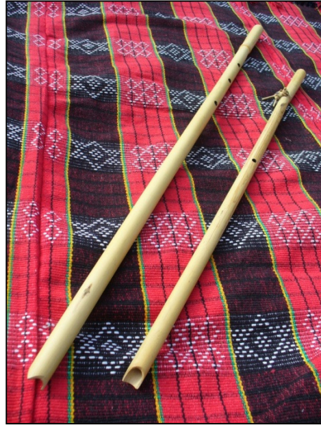
Figure 18: Paldong (lip valley flute).