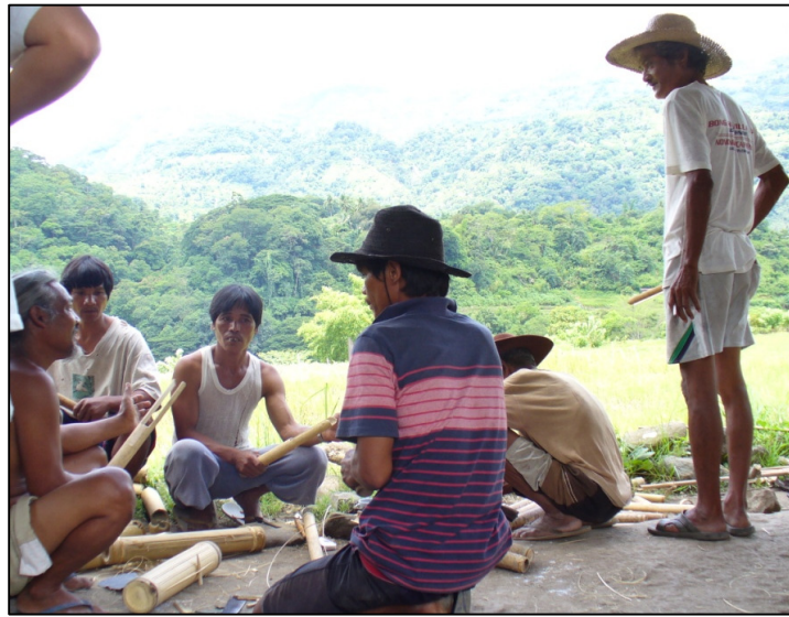
Figure 28: The group trying out Ben's ballingbing . (Photo by author, June 2007)

breaks into song, singing Salidummay, a song popular throughout the Cordillera, with lyrics from the local region of Kalinga. The atmosphere is of camaraderie and nostalgia. The singing seems to be an expression of brotherhood community. (Sukiap, Kalinga, 13 June, 2007)