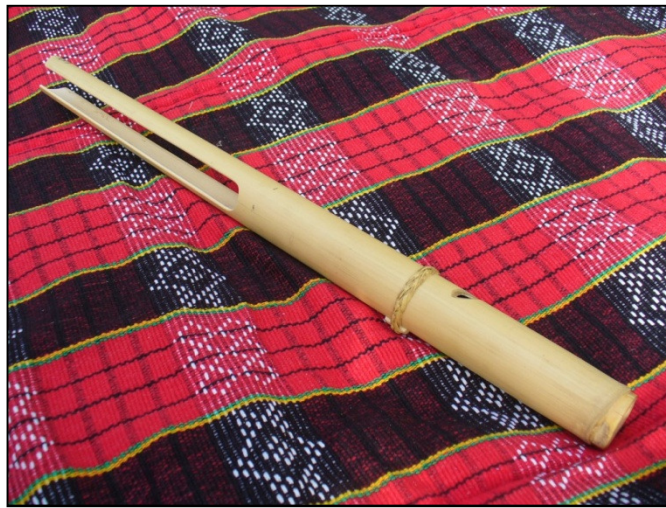
Figure 15: A single ballingbing . (Photo by author, August 2011)

To sound the ballingbing , the instruments are held in the hand at the base of the instrument near the closed node. The thumb hole should be located where the thumb would naturally sit. The ballingbing is struck onto the palm of the free hand above the wrist where it is firm, yet padded. Although rich in harmonics, a well played and well made ballingbing should have a clear resonant pitch and long sustain 42 .