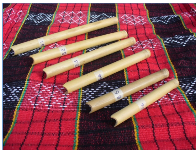
Figure 16: Set of saggeypo (note Beni's labels – the letter B refers to the set).

The saggeypo are another of the bamboo instruments that require very little modification from the raw material. A set of saggeypo consist of six individual, end blown, closed pipes. The narrow tips of bvulo , around two to three centimetres in width, are cut below the closed nodes as with the tongatong , pattanggok and ballingbing . The blown end is cut on two opposing, asymmetric diagonals, the long edge to be placed against the bottom lip when played. Unlike the percussion instruments ( tongatong , pattatag , pattanggok , ballingbing ), the saggeypo can be made of dried or freshly cut bvulo as the instrument does not rely on the hardness of bamboo for a percussive sound. The set of six saggeypo are tuned to the same relative pitches as the other ensemble instruments, and are also played in an alternating sequence, Ginallupak , with one player per pipe (see musical example: 1, below). Unlike the percussion instruments, however, the breath can be more expressive in sounding the note. (CD Track: 4)