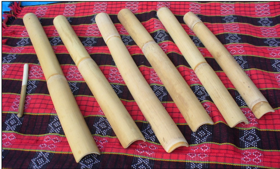
Figure 13: Pattatag or gallupak (bamboo xylophone blades).

Beni described the pattatag (xylophone blades) as the first instrument on which children would learn to play the basic alternating pattern of Ginallupak . The children could easily make the instruments themselves and play, practise and imitate the sounds of the gangsa played by their fathers (CD Track: 2).