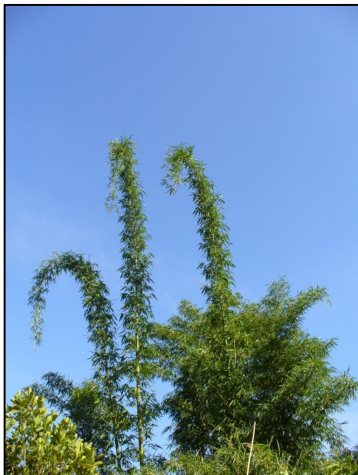
Figure 9: Feathery bvuyog culms, reaching up to eight metres in height. (Photo by Author, June 2007)

Bvuyog culms are prepared in much the same way as bvulo : they can be harvested after two to three years and, although thicker, drying takes a similar amount of time, around six months. The bvuyog internodes define the instruments length in the case of the tambi (two string, tube zither) and kolitong (six string, tube zither), both instruments having closed nodes at each end. The kulibaw (jaw harp) is carved from any piece of bvuyog of appropriate length.