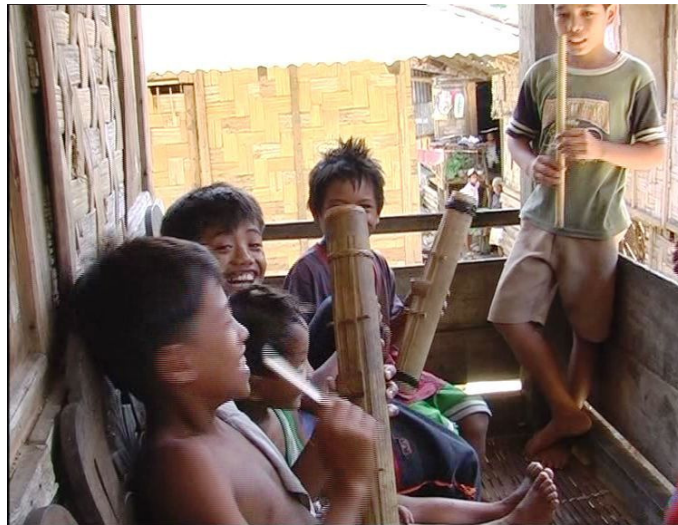
Figure 25: Children of Sukiap on Bagtang's veranda (Photo by author, June 2007)

Together, as an ad-hoc musical group of a mixture of solo and ensemble bamboo instruments, they continue to play the pulsating rhythm, shaping the intensity of music through metre and dynamics. The children also hint at the dance as they play, rocking gently and lifting their feet in time to the music as the dancers would do. After playing for a while, a friendly bustle breaks out leading to an exchange of instruments. Eventually the ensemble is reorganized with different players and the music starts up. (Sukiap, 17 June, 2007)