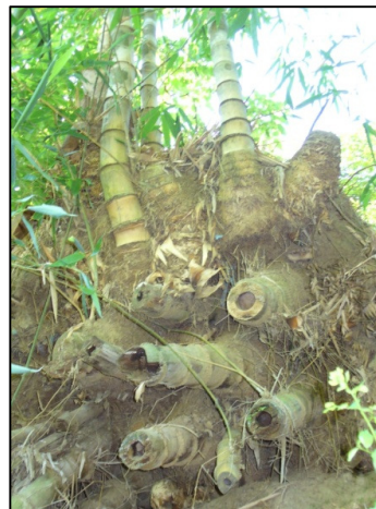
Figure 10: The base of the bvuyog where Beni has harvested culms for instruments.