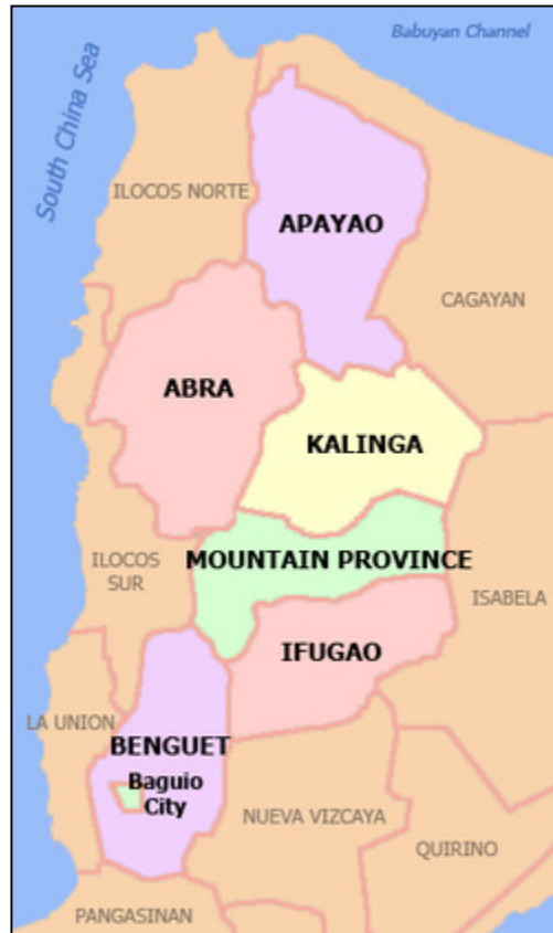
Map 2: Political Map of the Cordillera Administrative Region (Wikipedia.org 2011)