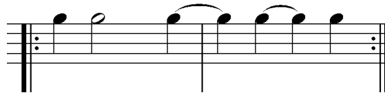
Musical Example 3: lalat eight beat phrase