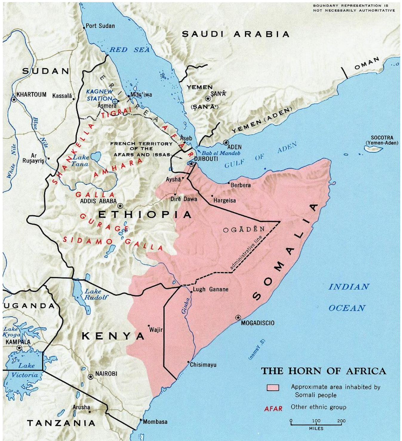
Map 1: The Sovereign state of Somalia, with the area inhabited by Ethnic Somali's outlined. Map from : http://rpmedia.ask.com/ts?u=/wikipedia/commons/thumb/2/26/Somali_map.jpg/200px-Somali_map.jpg 27.feb.2011