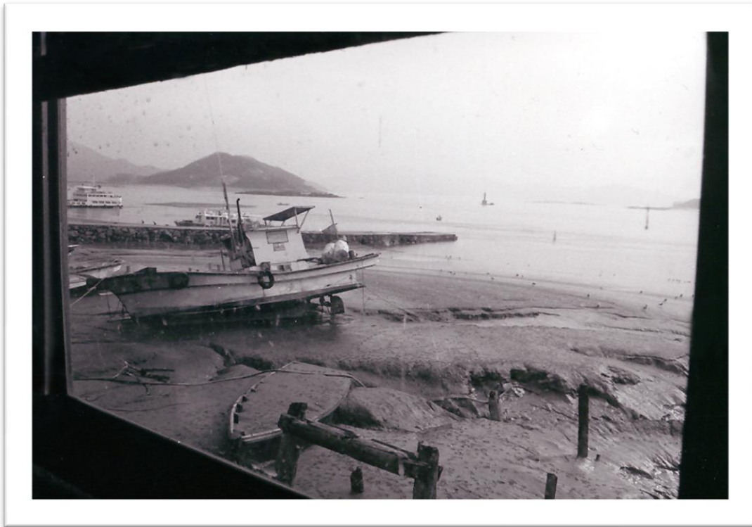
1 From the Window of a Sasbimi Restaurant - Incheon, South Korea. Picture by Aaron Irving 2004