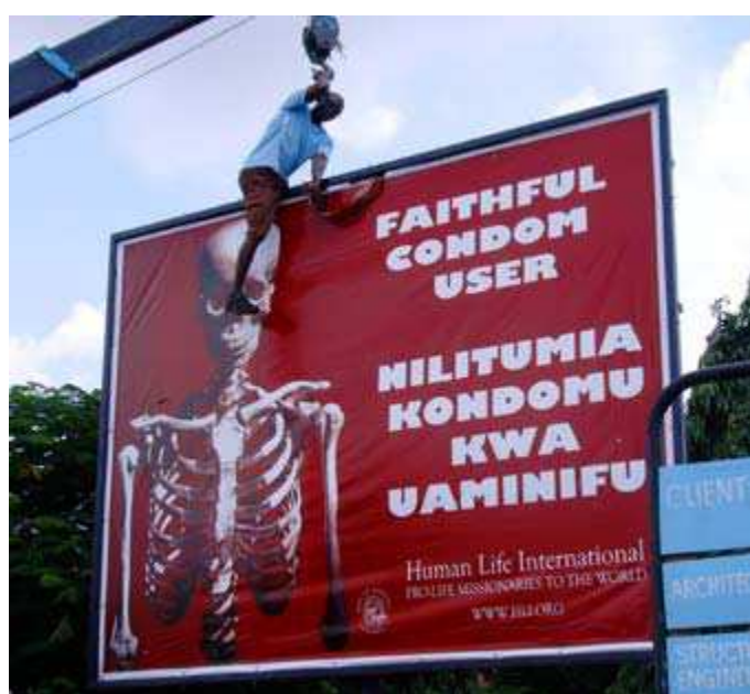
HLI Billboard, Tanzania, 2008 37

HLI appeals solely to conservative Catholics in its fundraising efforts. Utilising its steadily growing budget – now just under $4 million 36 – Euteneuer and his colleagues travel to far-flung destinations to spread HLI’s message. Unlike many ‘pro-family’ organisations, HLI funds are used for more than research and advocacy. In its international activism, HLI runs ‘crisis pregnancy’ centres, teaches courses on ‘natural family planning’ to young married couples, trains recruits all over the world to be domestic lobbyists and ‘pro-life’ counsellors, and hosts local ‘pro-life’ radio and television programmes in countries all around the world.