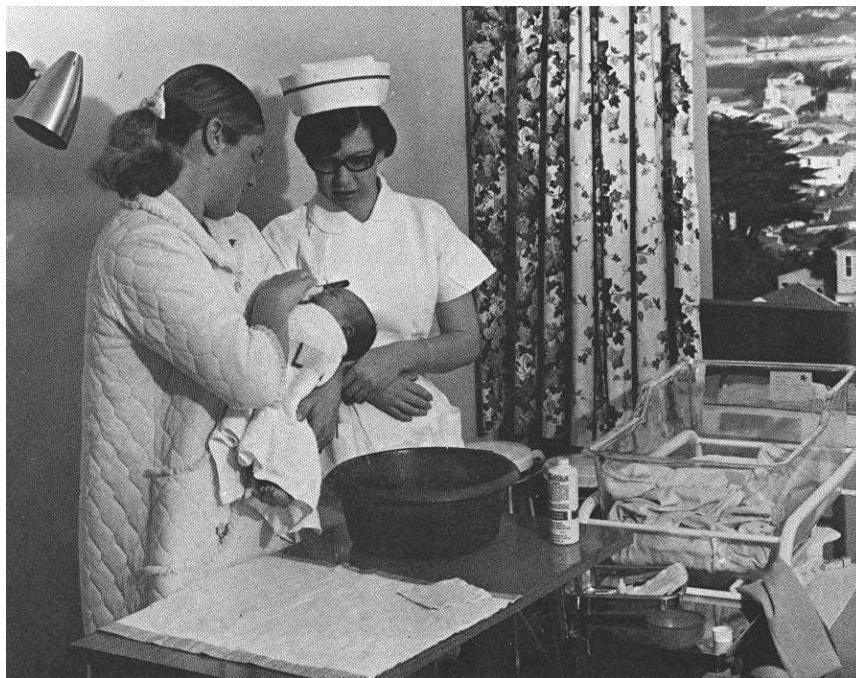
Figure 3. A postnatal room in the 'new' St Helens Hospital which opened in 1965.

The new hospital was very popular with women and the midwives. They liked the single rooms and the pleasant, clean and new surroundings.