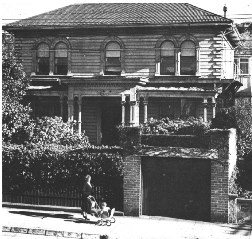
Figure 2. The Willis St. Obstetric Hospital. Circa 1947.