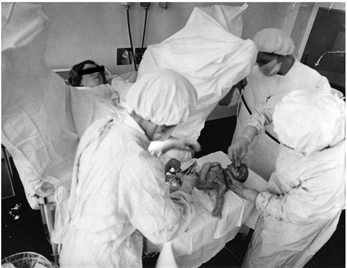
Figure 5. Birthing woman at St Helens Hospital, 1969. 219 An attendant suctions mucus from the newly born baby's airways.

Figure 5 is a photograph of a birthing woman in the usual lithotomy position while the doctor suctions mucus from baby and the midwife (or student) cuts the umbilical cord. It gives a sense of the woman's separation from what is occurring, and demonstrates how the clothing of the attendants (to maintain asepsis) could mask facial expression and inhibit communication. The woman was looking away from the area of activity and the photo conveyed a real feeling that the woman had been deprived of involvement in what was happening to her. Her position prevents her from seeing her baby and participating in the event. Indeed, we could speculate as to whether she had a choice whether the photo was taken or not, and for what purpose it was taken in 1969. It may be another example of the lack of autonomy which has been identified. With no support person near it certainly portrays 'aloneness' for the woman.