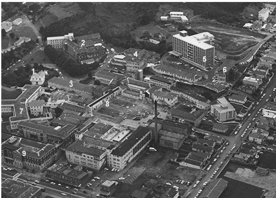
Figure 4. Wellington Public Hospital. Circa 1968.

with its own Maternity Annexe. The annexe was replaced by a new maternity block in 1966. In Knight's Road, Lower Hutt, also under the control of the Hospital Board was the nine-bed Te Marua Maternity Hospital which closed in 1966. Elderslea Hospital in Upper Hutt opened in 1961, with 40 beds with rooming 'in' facilities. 186