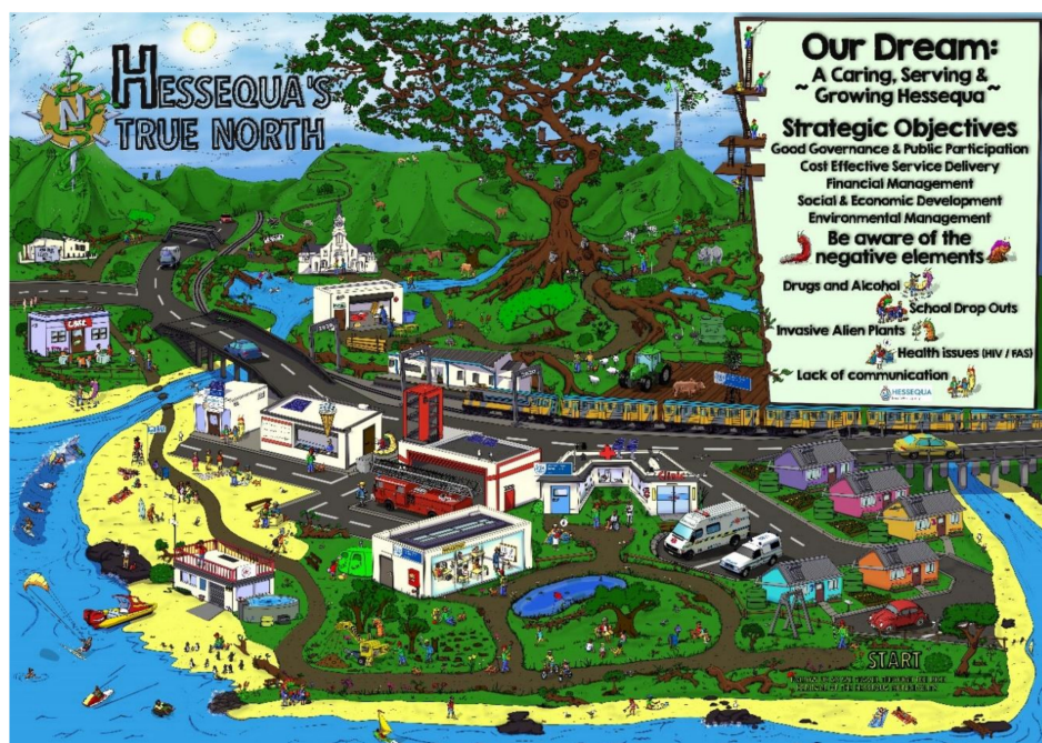
Figure 2. Example of a visualised strategy of a local government [25].

The visualised strategy is then used during the second workshop, held over two days, and focusing specifically on a sustainable energy future. The intent of the Explore segment during the second workshop is to creatively think about possible energy futures through firstly, presenting and discussing current trends with regard to sustainable energy and secondly, collecting data on how the participants foresee the specific local area within 20 to 30 years. The written statements about the future indicate the different mindsets and values of the participants. The discussion of these statements helps to gain consensus on where the municipality and its stakeholders see themselves in the future.