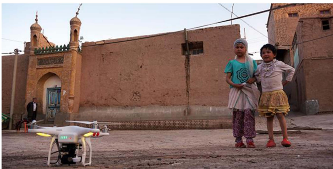
Fig. 3. Preparing for the aerial shootage over Gaotai.

Apart from photographs that may have nostalgic value years later, the data consists of a photogrammetric model of the Gaotai by means of the UAV (Unmanned Aerial Vehicles) technology (Fig. 3). Drawing on the ubiquity of the Kashgar architecture, this part of the research focuses on data harnessed from this typology and on its analysis from the existing architecture and its use as design driver for the next stage.