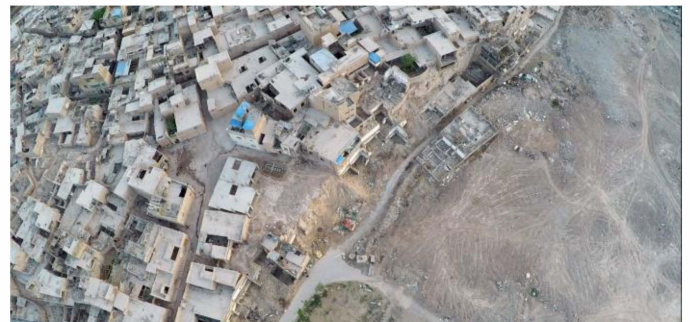
Fig. 1. "Gaotai" (高台) means high platform as is named "Kozichiyar Beshi" (كوزچىيار بېشى) in Uyghur. Its traces date back over 2,000 years ago

changes from its origin due to the new concrete structures replacing old mud-brick houses. The city has been losing its narrow alleys, thus character, that were once a joy to find a way through their complicated visual synchrony. There emerges the objective of this project together with its scope. What is significant in applying shape grammars is testing to see how much they can reinvigorate the whole character of an entity at city scale with limited sources for analysis. The current preservation plan does not allow a small section of the old-town to be demolished, which makes up to only fifteen per cent of the whole site. The fragment of the city is called Gaotai which forms the scope of our research. This small neighbourhood is part of the preservation plan which is identified as an open museum (Fig. 1).