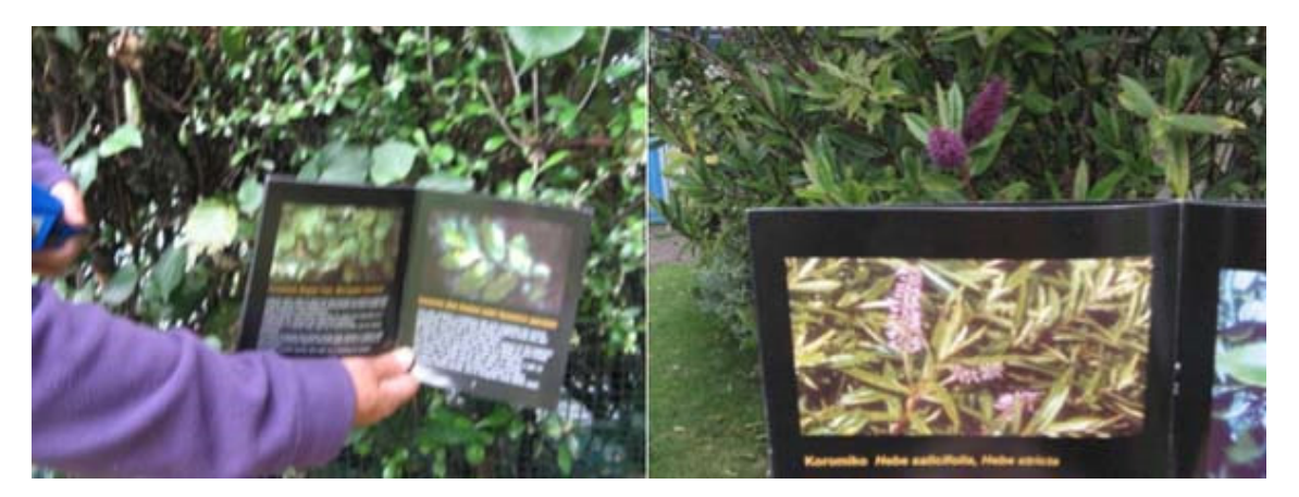
Figure 3. Identifying indigenous plants and their healing properties, Hawera Kindergarten.

renarrativisation addresses the 'matter of concern' of the suppression of indigenous ways of knowing, being and doing.